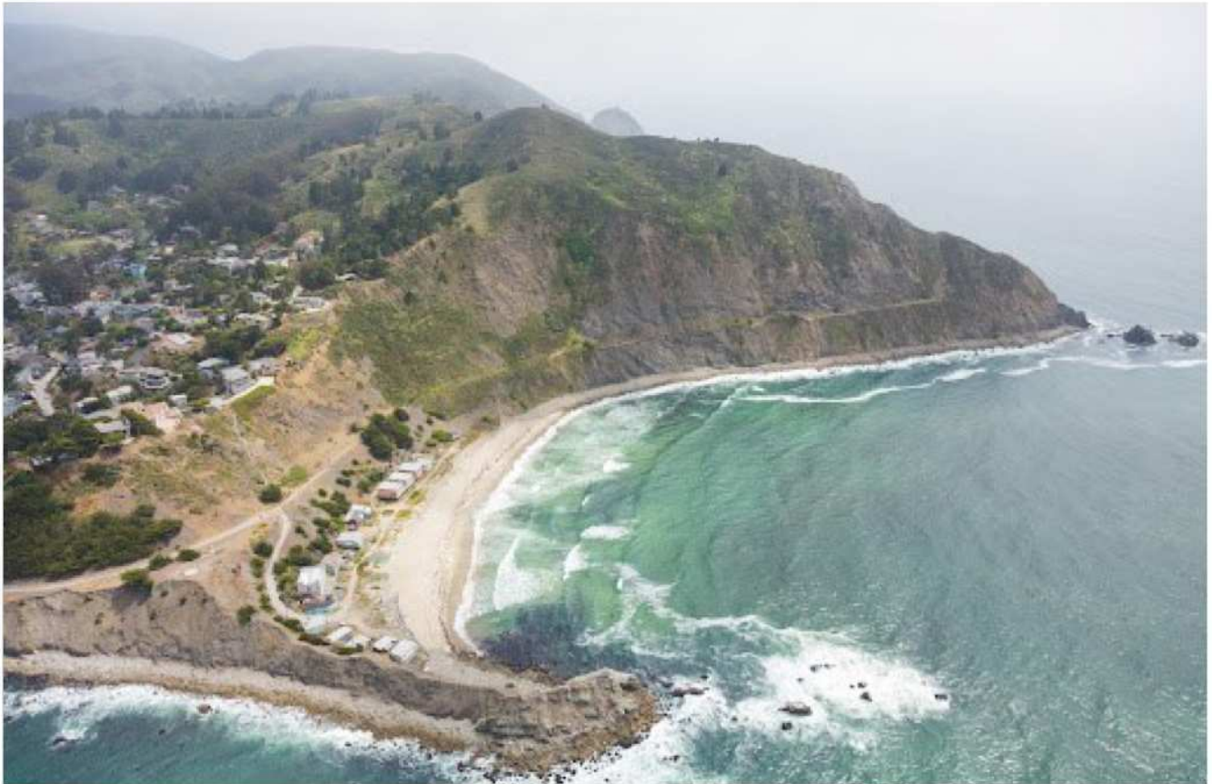
Historic Shelter Cove and Pedro Point