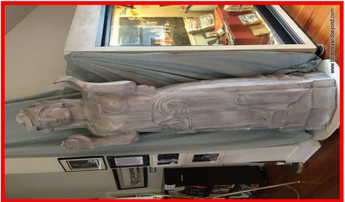
Goddess Pacifica, the Goddess of Peace - Displayed at the Coastside Museum