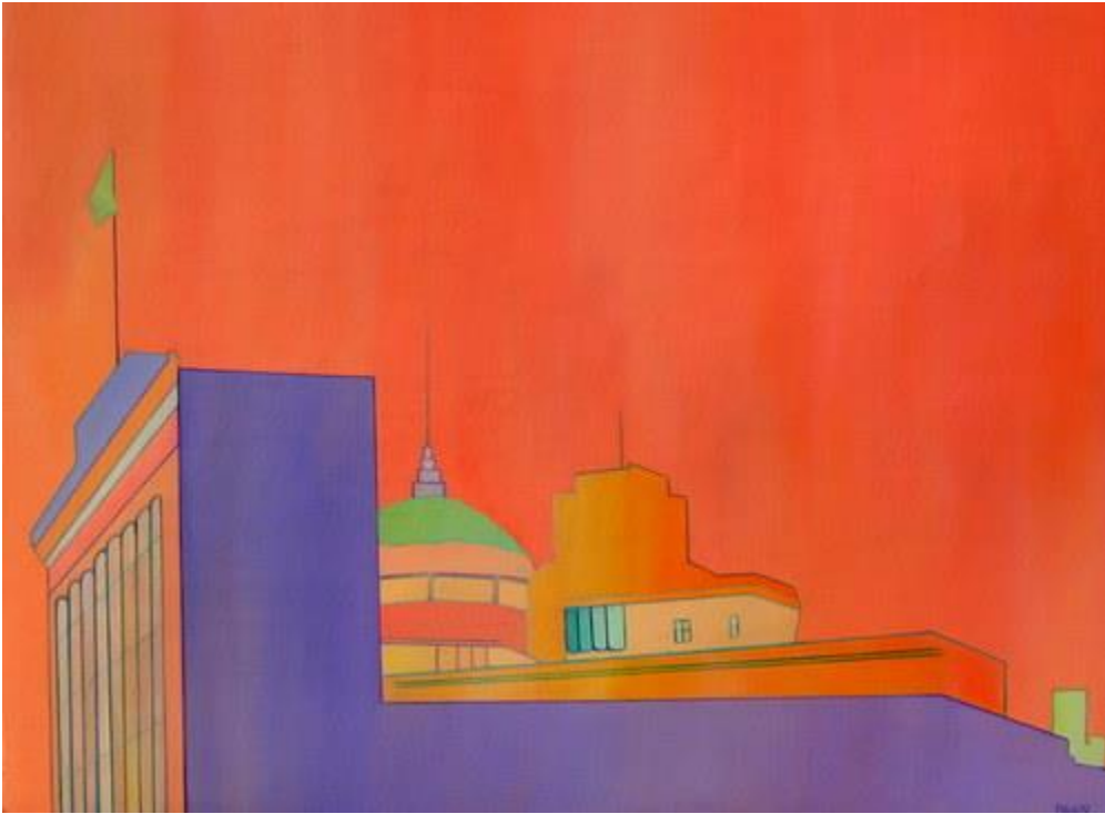
Photo above: A New Day: 6th and Market , (oil on panel), by Patricia Araujo

The main room, because of its sheer size, multiple uses, and overwhelming ceiling beams works less well for the collaboration, especially for Mark, who has to compete with the fenestration rhythm of many small windows and doors. It is in this room that Patricia can flex her mural muscle, and show that she can command large-scale color and composition. Like Mark, she continues to play with text. Metamorphosis II , 48x68”, is a strong set of forms that crackle as they slash into each other. Under the well-known Emporium Dome floats a sign—Sheedy, a famous San Francisco construction icon. It instantly refers us back to the city, to construction, redevelopment. But at blurry first glance it could say “seedy”. Or is it an even more scatological reference to city construction standards. All the more powerful criticism, coming from the face of Chanel!