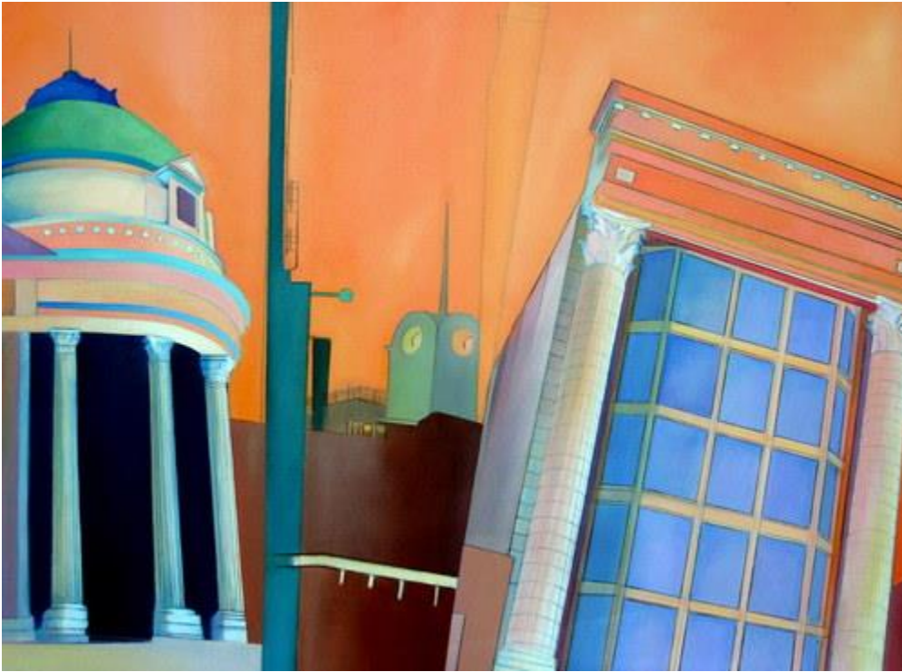
Photo above: Hibernia meets Furniture and Carpets , (oil on canvas), by Patricia Araujo